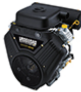
Vanguard Big Block V-Twin 35hp