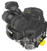
Vanguard 810cc V-Twin Vertical