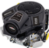
Vanguard Commercial Series V-Twin Vertical