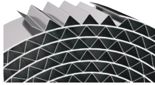
Nett® FX-Series™ Flame Arrester Element

Nett® FX-Series™ Flame Arrestors are made of a crimped wound metal ribbon element as shown in the picture below.