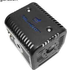
Custom muffler design

Other configurations and designs are available. Contact sales for further details.