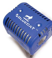
Compact muffler configuration