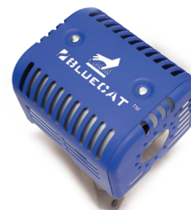
Compact muffler configuration