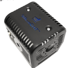
Custom muffler design

Other configurations and designs are available. Contact sales for further details.