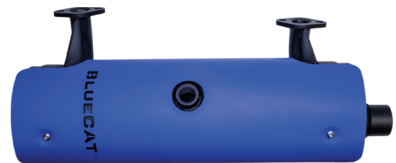
V-Twin muffler configuration